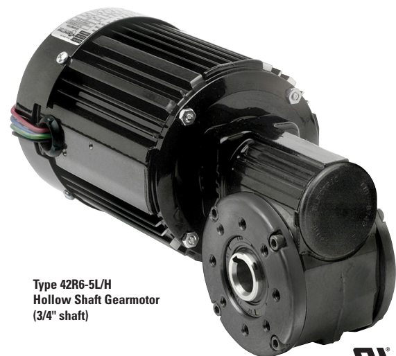
Type 42R6-5L/H Hollow Shaft Gearmotor (3/4" shaft)