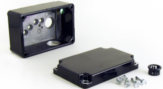
Model 0984 (regular) Model 0986 (large) Die cast terminal box kits

Over 1,500 standard gearmotors, motors and system-matched speed controls.