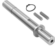
Model 0935 3/4" double extension stainless steel shaft kit