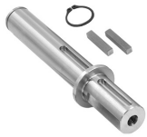
Model 0934 3/4" single extension stainless steel shaft kit