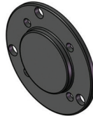
Model 0951 Shaft cover kit