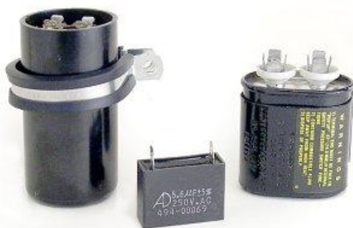
Capacitors for Fractional Horsepower Motors and Gearmotors (left to right: Electrolytic, Metallized Film, and Oil-Type)

The CS motor is essentially a split-phase motor with a capacitor for starting (see our catalog S-16 , page 43, or the Bodine Handbook for additional info). The motor has two windings: a main or run winding, and an auxiliary or start winding. The start winding is used only for starting the motor. The run winding is energized for starting and running. Because of the capacitor in the start winding, currents in the two windings are out-of-phase. This out-of-phase relationship sets up a rotating magnetic field that starts the rotor turning. When the motor accelerates to approximately 70% of its normal operating speed, the start winding and capacitor circuit are disconnected by a speed-sensitive centrifugal switch, a current-sensing relay, or other means.