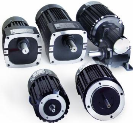
AC (Fixed Speed) Induction Motors and Gearmotors from Bodine Electric Company.

The PSC motor operates similarly to a two-phase motor and is, therefore, inherently more quiet and efficient than a CS motor. However, the phase angle in a PSC motor changes with load so that the motor usually is less efficient during starting than during running. In usual motor design, a compromise is made between the two operating points. Changing the capacitor value as specified by the manufacturer will affect both running and starting characteristics so that any improvements in starting usually decrease running performance. For example, a 200% increase in capacitance in a typical 1/15-hp motor approximately doubles the starting torque. However, the running efficiency of the motor drops from approximately 50% to 18%, and serious overheating of the motor results. Many motors are designed to operate close to the thermal limit of their insulation class rating. An increase in capacitance can increase the winding temperature rise above the allowed limit.