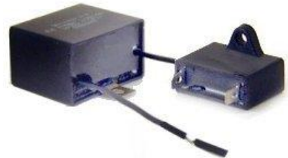
Motor Run Capacitors (plastic box type); Metallized Polypropylene Film.

A PSC motor is similar to a CS motor and also contains two windings: a main winding and a capacitor winding. In a PSC motor, however, the capacitor winding is permanently connected in series with an ac oil-type or metallized film capacitor. Unlike the CS motor, the auxiliary winding and capacitor are energized during both starting and running. Thus, continuous-duty ac oil-type or metallized film capacitors are installed in PSC motors. The dielectric in the capacitor is an oil-impregnated paper or plastic film as opposed to the aluminum oxide in ac electrolytic capacitors. The oil-type capacitor is inherently larger and more costly than the metallized film or electrolytic type.