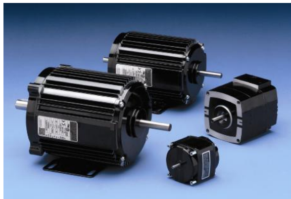
Various Permanent-Split-Capacitor (PSC) Motors from Bodine

Capacitors for permanent-split-capacitor (PSC) and capacitor-start (CS) AC induction motors are sized by motor manufacturers to produce adequate starting torque for most fractional-horsepower (FHP) applications. To increase starting torque, users sometimes replace factory-installed capacitors with larger ones. But tampering with recommended capacitances could adversely affect some important motor parameters such as starting current and running efficiency. If these parameters get too far out of line with motor-design specifications, windings overheat and ultimately burn out. Here’s how PSC and CS motors operate, and how changes in capacitance affect motor performance.