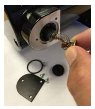
Grab the spring and remove the old brush assembly from the brush holder.