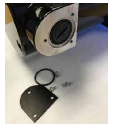
Remove the metal brush cap shield and the rubber O-ring beneath it.