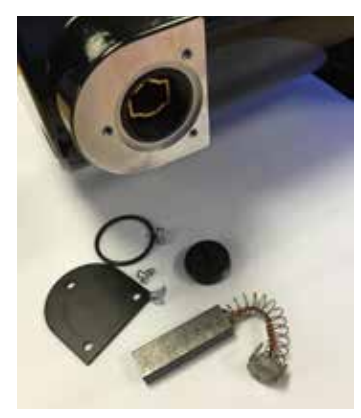
Repeat the previous steps for the other brush on the other side of the motor.