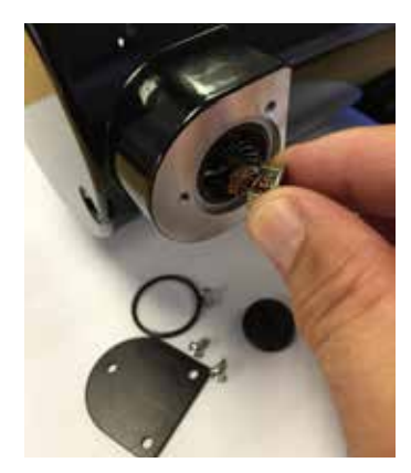
Reverse the order of these steps to install the new parts. Guide spring coils into holder and secure metal tab flush with brass insert before installing threaded brush cap. Install O-ring and brush cap cover plate.