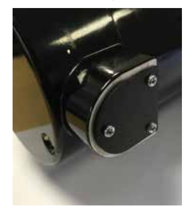
Find the location for one of the brushes, using the photo above as a reference.