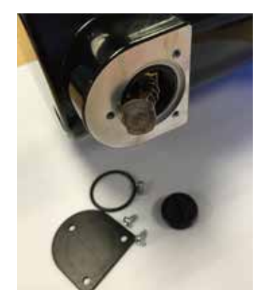
When the brush cap is removed, the brush spring will pop out.