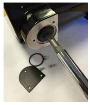
Remove the plastic brush cap with a large slotted screwdriver.